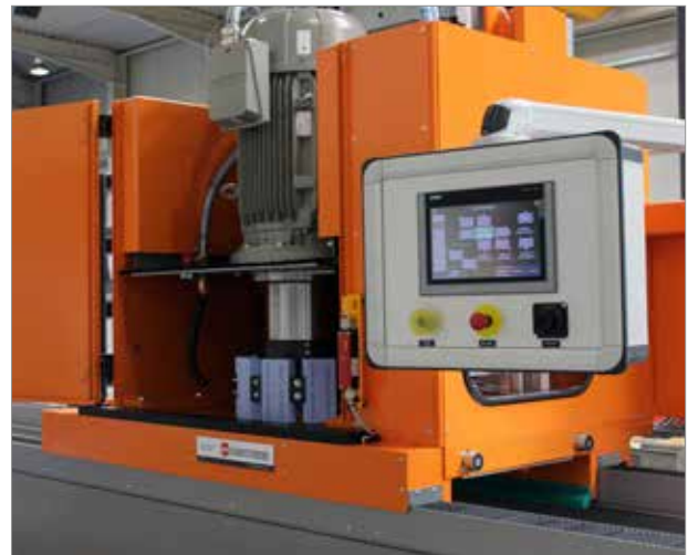
Picture: SOLUTIONgrinder Type 6000SM

MSB GmbH & Co. KG | Lindenstrasse 12 | 97653 Bischofsheim/Rhön | Germany