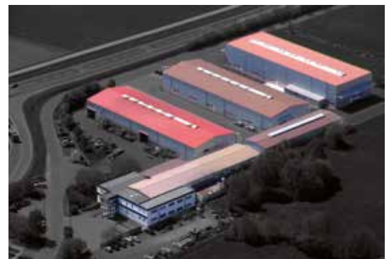
MSB Schmittwerke 2, Industrial area Bischofsheim