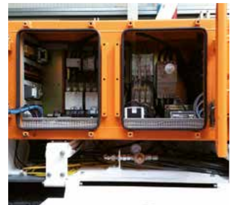
Inside view switch gear cabinet