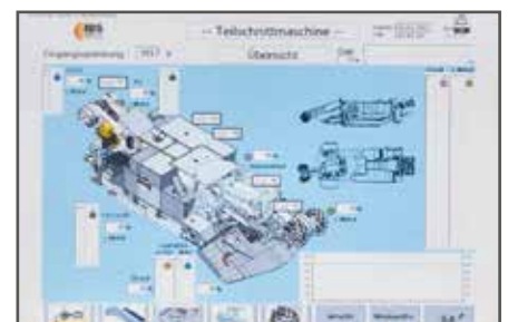
Display for visualization of the machine status